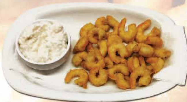
Çıtır Karides Pane 820 ₺ Crispy Breaded Shrimp Хрустящие креветки в панировке روبيان مقرمش بالبقسمات