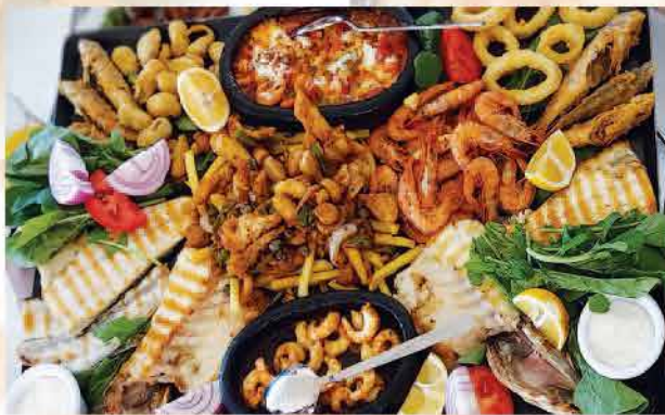
Karışık Balık _____ ₺ Mixed Fish / Mix Fisch La Plata Mixta de Pescado смешанная рыба السمك المشكل 450 / 500 GR