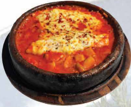
Vejeteryan Güveç 1000 ₺ Vegetarian Casserole Vegetarischer Auflauf Cazuela vegetariana Вегетарианская запеканка طاجن نباتي