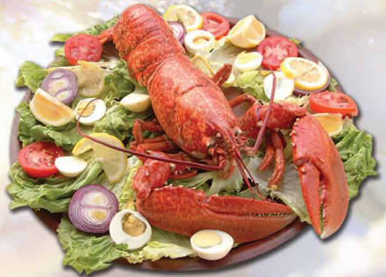
Istakoz Kg. _____ ₺ Lobster Hummer Langosta Омар سرطان البحر كغم