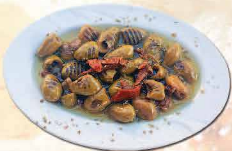
Izgara Yeşil Zeytin 300 ₺ Grilled Green Olives

Жареные зелёные оливки на грил زيتون أخضر مشوي