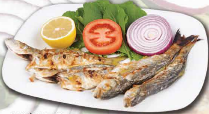
220 / 280 GR _____ ₺ Çinekop Small Bluefish Kleiner Blaufisch Pescado Azul Joven маленькая луфарь سمكة صغيرة مزرققة