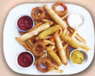
Atıştırma Tabakası Appetizer Plate