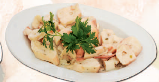
Ahtapot 600 ₺ Octopus Осьминог الأخطبوط