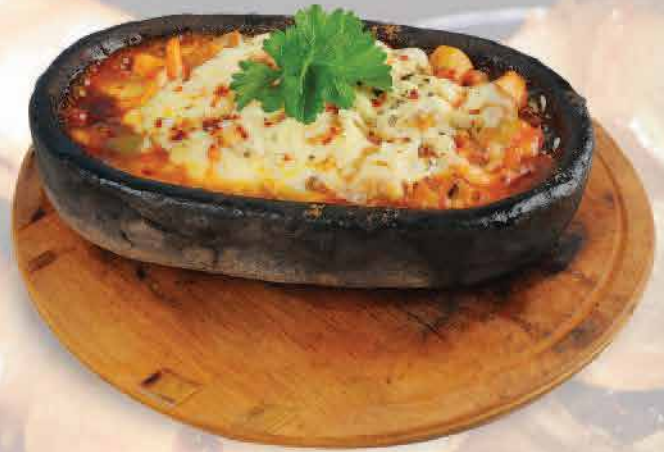
Karides Güveç 700 ₺ Shrimp Casserole Запеканка с креветками طاغن الروبيان 180 / 200 GR