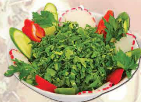
Yeşil Salata 400 ₺ Green Salad Зеленый салат سلطة خضراء