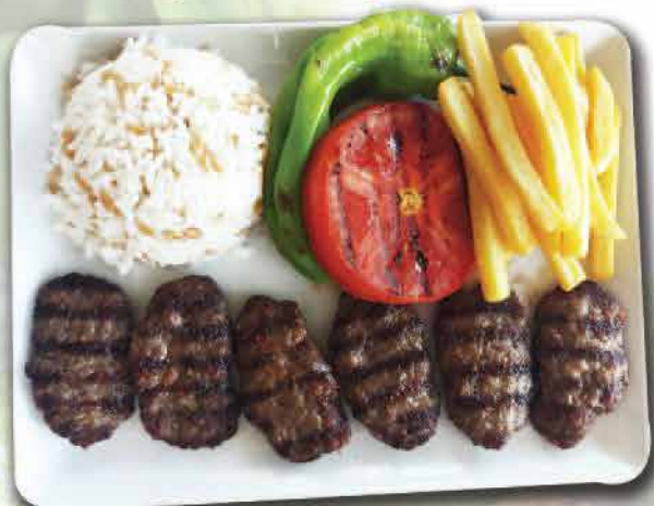
Izgara Köfte 650 ₺ Grilled Meatballs Gegrillte Frikadellen Albóndigas a la Parrilla Котлеты на гриле الكفتة المشوية 180 / 220 GR