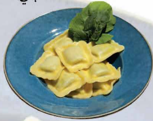
Ispanaklı Ravioli 900 ₺ Ravioli with Spinach Ravioli mit Spinat Ravioles con espinacas Равиоли со шпинатом راقبولى مع السبانخ