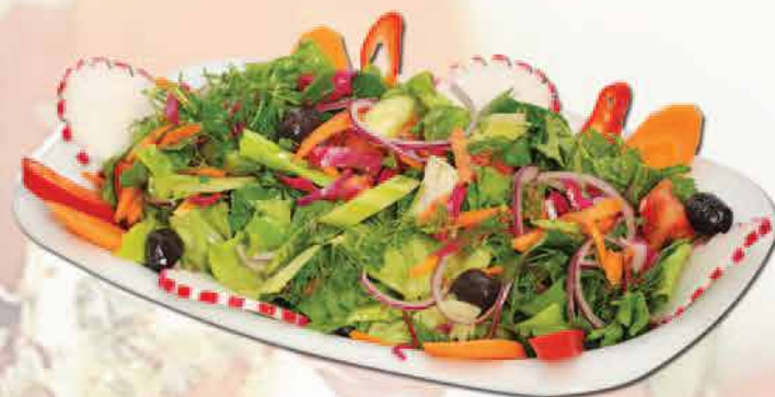
Nevzat Salata 450 ₺ Nevzat Salad Nevzat Салат سلطة