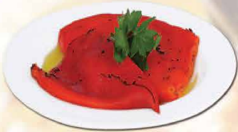
Közde Kırmızı Biber 300 ₺ Roasted Red Pepper

жареный красный перец الفلفل الأحمر المحمص