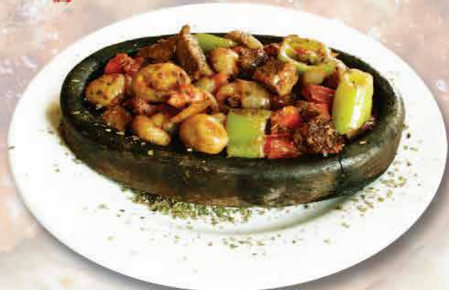
180 / 220 GR Çoban Kavurma 1200 ₺ Fried Diced Lamb Gebratenes Fleisch in Hirtenart / Estofado Жаркое По Пастушы الراعي المقلي