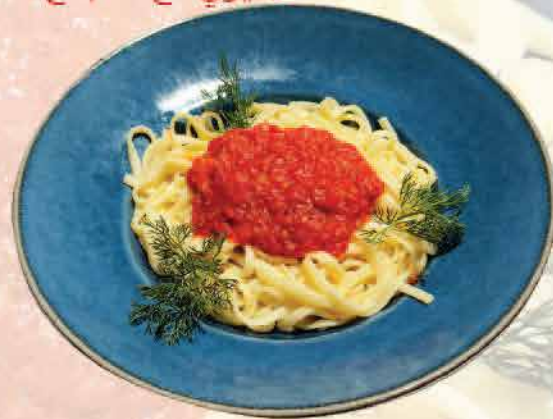
Domates Soslu Linguini 700 ₺ Linguini with Tomato Sauce Linguine mit Tomatensauce Linguine con salsa de tomate Лингвини с томатным соусом لينجويني مع صلصة الطماطم