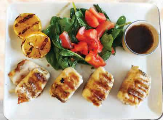
Izgara Levrek Sarma 1000 ₺ Grilled Seabass Roll 300 GR