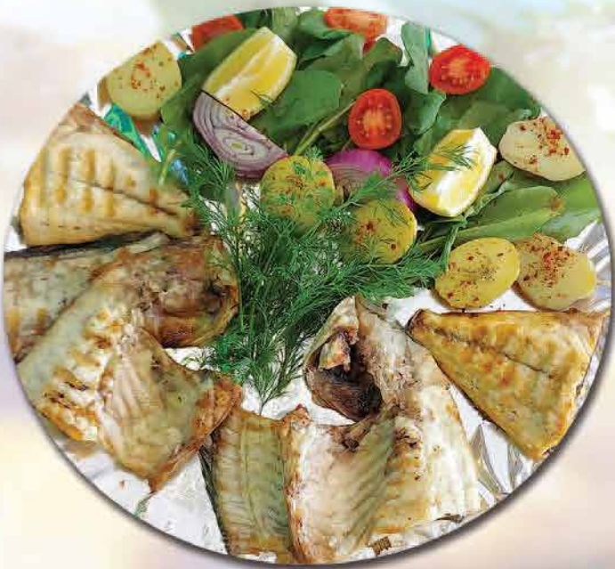
Deniz 2700 ₺ Çuprası Kg. Sea Bream / Meerbrasse Dorada de Mar Морской Дорада قاروص البحر كغم