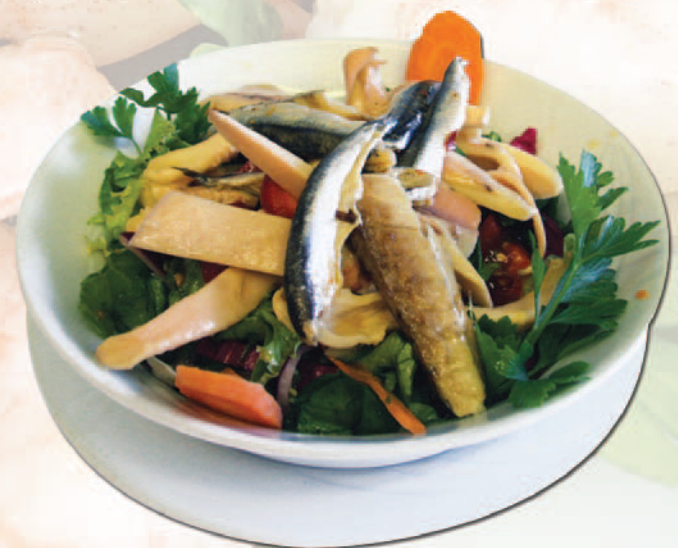
Deniz 900 ₺ Mahsulleri Salatası Salad with Seafood Салат с морепродуктами سلطة مع المأكولات البحرية