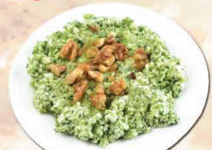
Girit Ezmesi 400 ₺ Cretan Paste

жареные баклажаны с йогуртом и томатным соусом بادنجان مقلي مع الزبادي وصلصة الطماطم