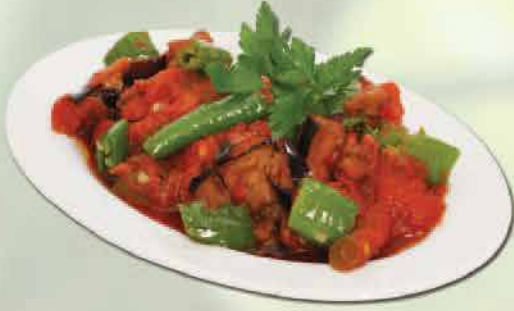
Patlıcan Soslu 300 ₺ Eggplant with Sauce баклажаны с соусом بادنجان مع صلصة

%10 Service fee will be added. / %10 Servis Ücreti Eklenecektir.