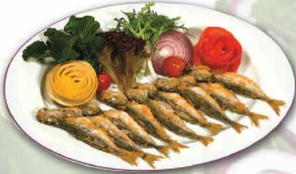
İstavrit 650 ₺ Horse-Mackerel Stöcker Jurel Ставрида ایستا فريت 220 / 280 GR