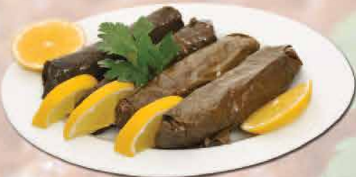
Yaprak Sarma 350 ₺ Stuffed Vine Leaves фаршированные виноградные листья ورق عنب محشي