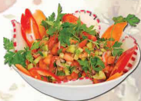
Çoban Salata 400 ₺ Shepherd's Salad Салат Шепарда سلطة الراعي