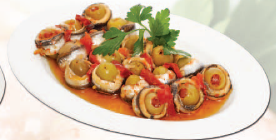
Zeytinli 520 ₺ Hamsi Dolma Stuffed Olive Anchovy Фаршированные оливковые анчоусы أنشوجة محشوة بالزيتون