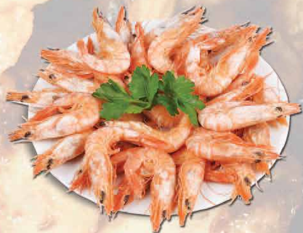
Karides Haşlama 750 ₺ Boiled Shrimp Вареные креветки روبيان مسلوق