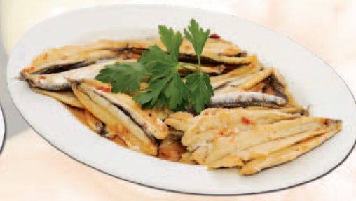
Salamura 500 ₺ Hamsi Pickled Anchovy маринованный анчоус الأنشوجة المخللة