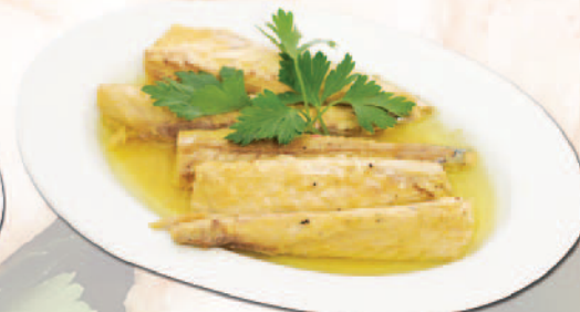
Uskumru 500 ₺ Marine Marinated Mackerel Маринованная скумбрия سمك الماكريل المتبل