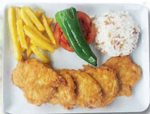
240 / 280 GR Şinitzel 750 ₺ Chicken Schnitzel Hähnchen Schitzel Schnitzel de Polpo Куриный шницель شنيترز