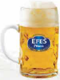
Efes Fıçı / Draft