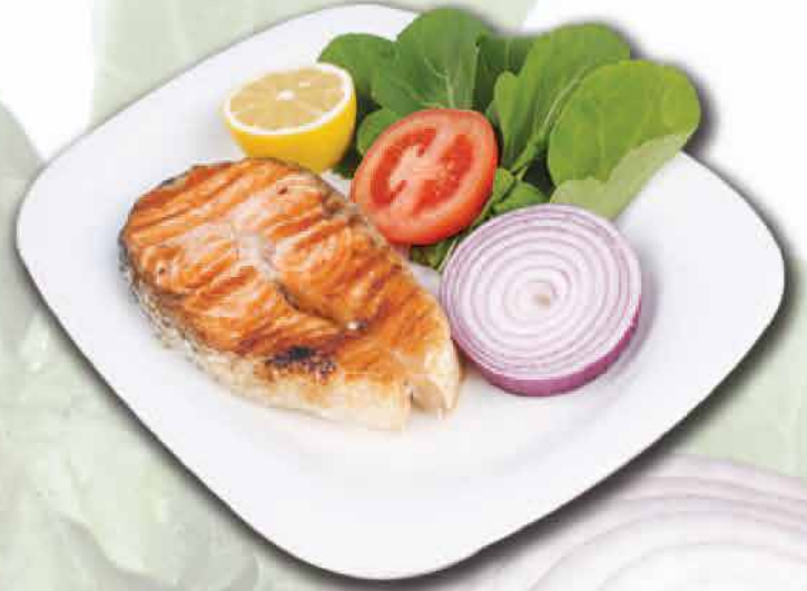
250 GR Somon 1100 ₺ Salmon Lachs / Salmón Лосось سمك السلمون