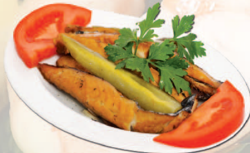
Çiroz 500 ₺ Killer Fish Рыба-убийца سمكة القاتل