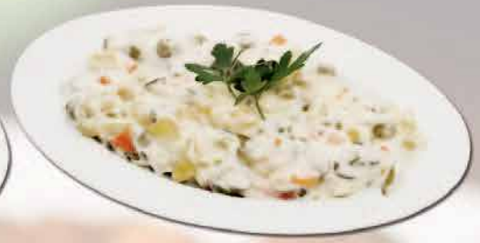
Rus Salatası 300 ₺ Russian Salad русский салат سلطة روسية