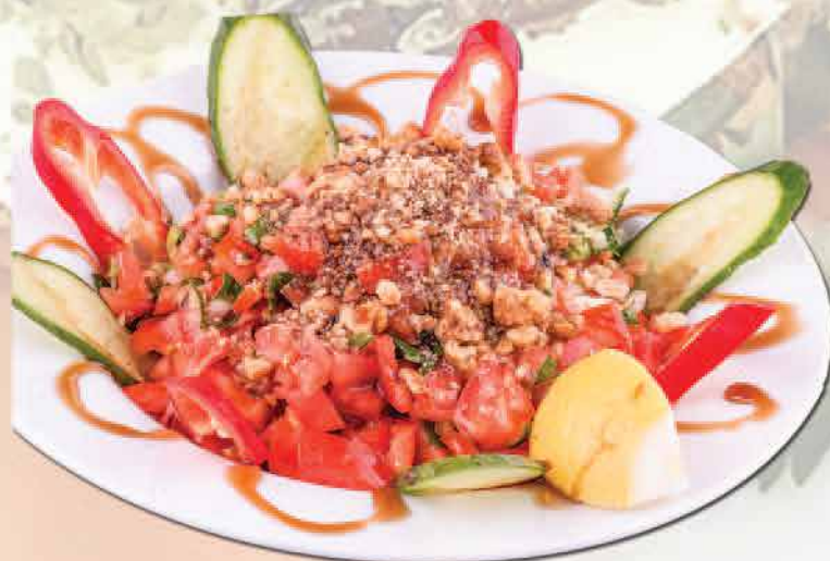
Gavurdağ Salata 550 ₺ Gavurdağ Salad Салат Гавурдаги سلطة غافورداجي