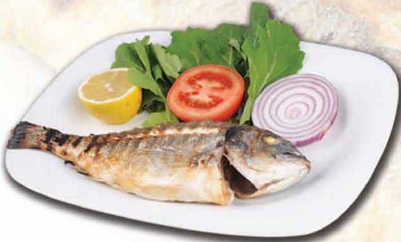
340 / 400 GR Çupra 750 ₺ Bream Brasse / Dorada Дорада الدنيس