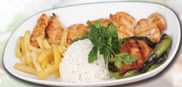
240 / 280 GR Tavuk Şiş 600 ₺ Chicken Shish Hähnchen Shish Kebab Pinchos de Pollo Курица Шпажках تكة الدجاج