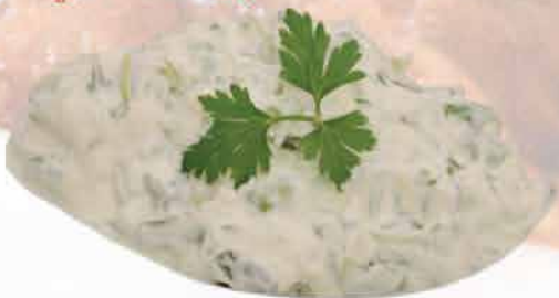
Semizotu 300 ₺ Purslane with Yoghurt портулак с йогуртом الرجلة مع الزبادي