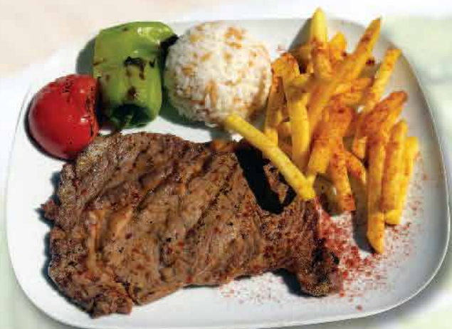
180 / 220 GR Antrikot 1300 ₺ Entrecote / Rib Steak Entrecot Антрекот الانتركوت