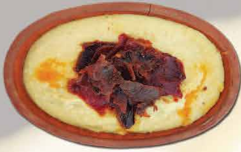
Pastırmalı Humus 450 ₺ Hummus with Pastrami