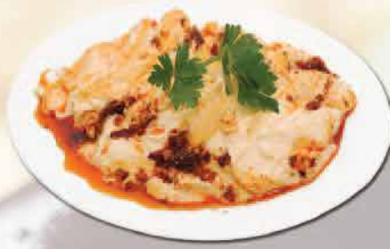
Acılı Atom 350 ₺ Spicy Atom