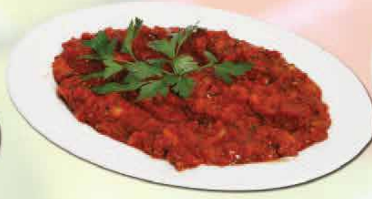
Acılı Ezme 300 ₺ Spicy Mash острое пюре هريس حار