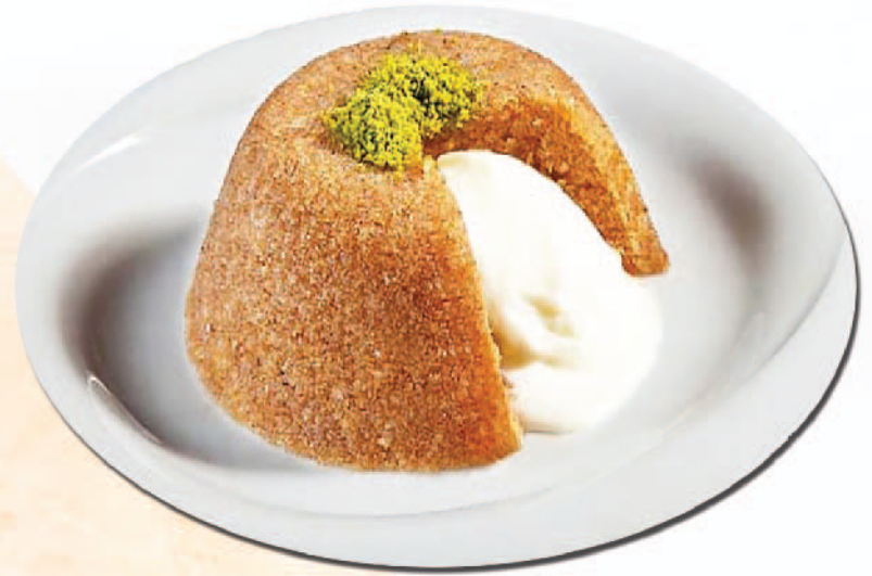
Dondurmalı Irmik Helvasi 500 ₺

Semolina Dessert with ice cream Grieß-Dessert mit Eis Postre de sémola con helado мороженое манная халва ايس كريم سميد حلاوة طحينية