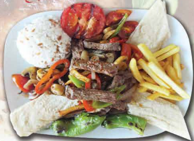
180 / 220 GR Paşa Kebabı 1300 ₺ Pasha Kebab паша кебабы كباب الباشا