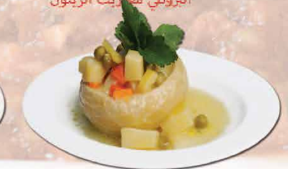
Zeytinyağlı Enginar 400 ₺ Artichoke with Olive Oil артишок с оливковым маслом الخرشوف مع زيت الزيتون