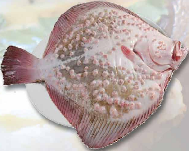
Kalkan Kg. 6000 ₺ Turbot / Steinbutt Rodaballo Камбала سمك الترس كغم