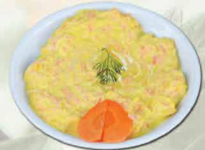
Havuç Tarator 300 ₺ Carrot Tarator