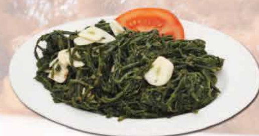
Deniz Börülcesi 300 ₺ Sea Beans морские бобы فاصوليا البحر