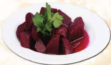
Pancar Turşusu 300 ₺ Beet Pickle