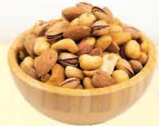
Karışık Çerez Mixed Nuts