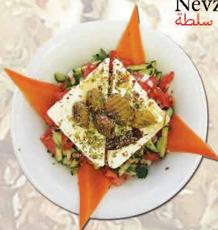
Greek Salata 450 ₺ Greek Salad Греческий салат سلطة يونانية