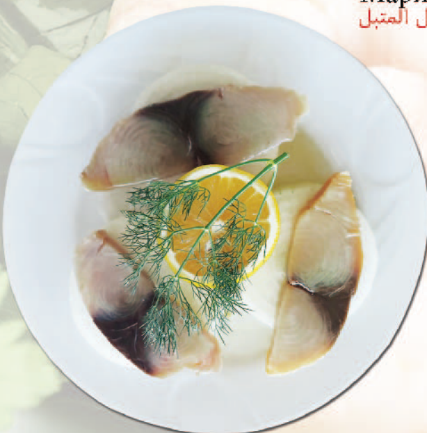
Lakerda 1500 ₺ Pickled Tunny Маринованный тунец تونة مخللة