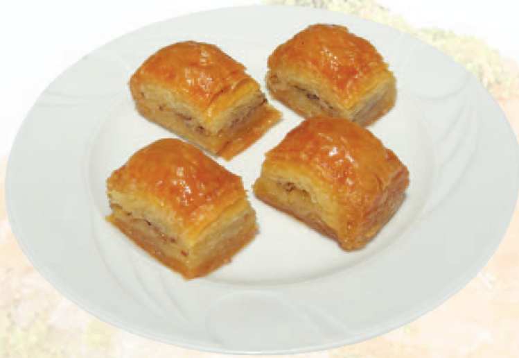
Baklava 500 ₺