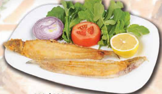
220 / 280 GR 1200 ₺ Dil Balığı Sole Fish Flunder Lenguado Comun Морской язык سمك اللسان