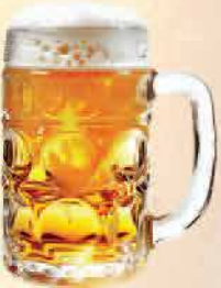
Belfast Fıçı Draft