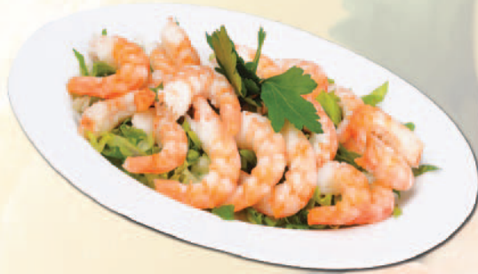
Karides 680 ₺ Shrimp Креветка الروبيان