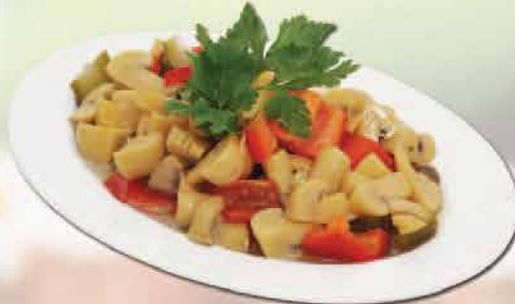
Mantar Salatası 300 ₺ Mushroom Salad грибной салат سلطة الفطر