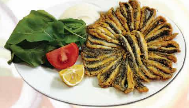
Hamsi Tava 600 ₺ Fried Anchovies Gebratene Sardellen Anchoas Fritas Жареные Анчоусы سمك الانشوا بالملقلا 220 / 280 GR