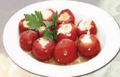
Kiraz Biber 300 ₺ Cherry Pepper

жареный красный перец الفلفل الأحمر المحمص