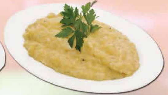
Patlıcan Ezmesi 300 ₺ Eggplant Roots паста из баклажанов معجون البادنجان