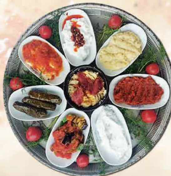
Ordövr Tepsi 2200 ₺ Hors d'oeuvre Tray

Жареные зелёные оливки на грил زيتون أخضر مشوي