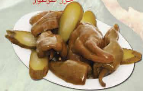
Biber Turşusu 300 ₺ Pepper Pickle