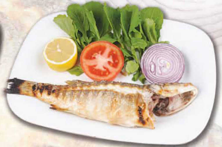
340 / 400 GR Levrek 750 ₺ Bass Barsch / Perca Сибас البرش