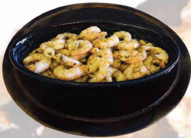
Tereyağında 750 ₺ Karides / Shrimp with Butter Креветки с маслом روبيان بالزبدة 180 / 200 GR