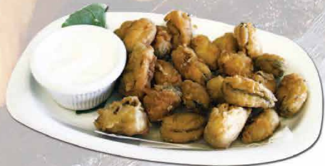
Midye Tava 600 ₺ Fried Mussels Жареные мидии بلح البحر المقلي