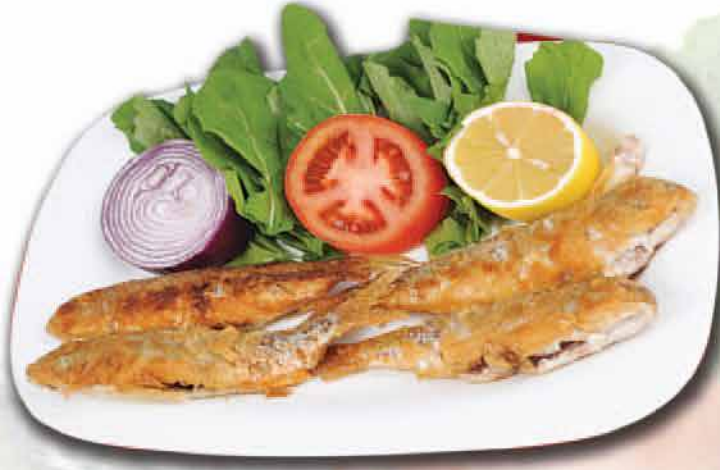
220 / 280 GR Barbunya 1100 ₺ Red Mullet Rotbarbe / Salmonetes Барабулька الباربونيا