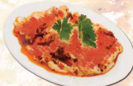
Köpoğlu 300 ₺ Fried Eggplant with Yoghurt and Tomato Sauce

жареные баклажаны с йогуртом и томатным соусом بادنجان مقلي مع الزبادي وصلصة الطماطم