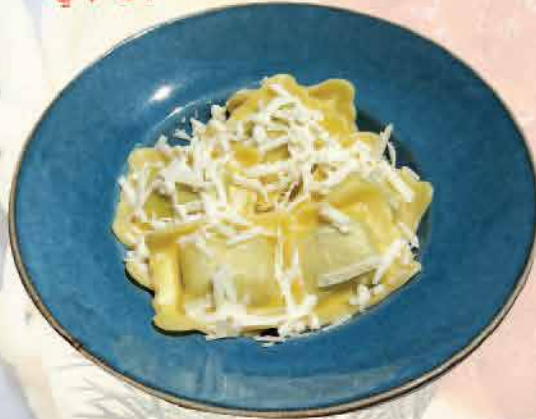
Peynirli Ravioli 900 ₺ Ravioli with Cheese Ravioli mit Käse Ravioles con queso Равиоли с сыром راقبولى بالجبن