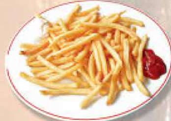
Patates Tava French Fries