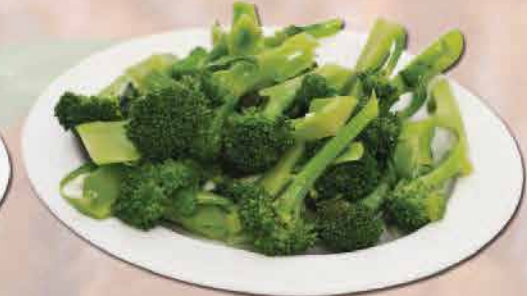
Zeytinyağlı Brokoli 300 ₺ Broccoli with Olive Oil брокколи с оливковым маслом البروكلي مع زيت الزيتون