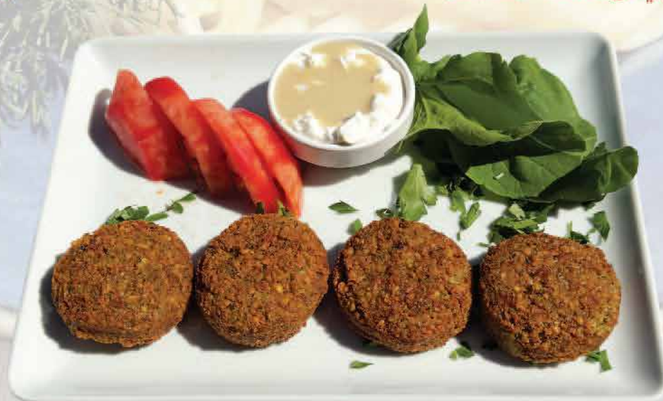
Falafel 700 ₺ фалафель فلافل