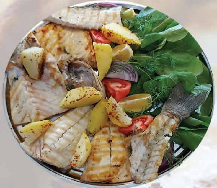
Deniz Levreği Kg. 3000 ₺ Sea Bass / Meerbrusch Perca de Mar Морской Сибас برش البحر كغم