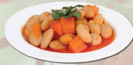
Pilaki 300 ₺ Haricot Bean пилаки پيلاكي