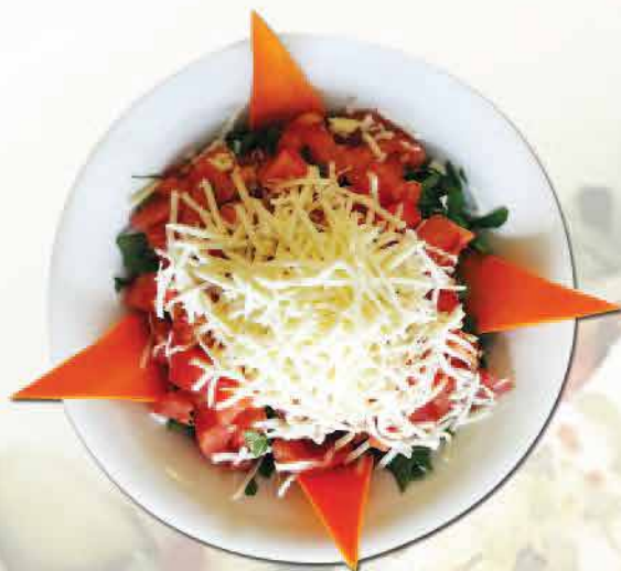
Roka Salata 400 ₺ Rocket Salad Салат из рукколы سلطة الجرجير