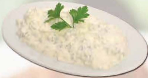
Haydari 300 ₺ Thick yoghurt with garlic and dill хайдари خيدري