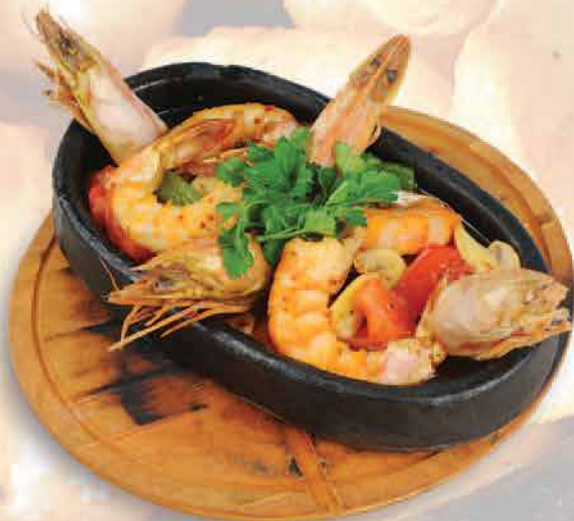
Jumbo Karides 1500 ₺ Jumbo Shrimp Большие креветки روبيان جامبو